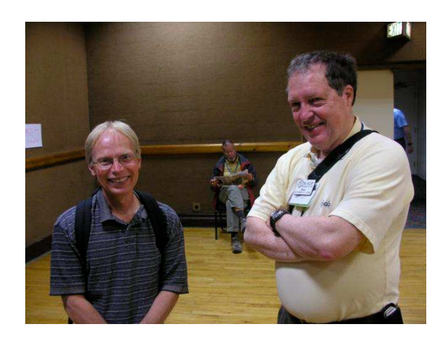
8913 - Some of our members