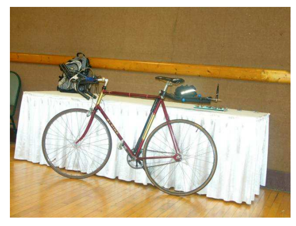
8929 - Norm, N9ZKS, track bike