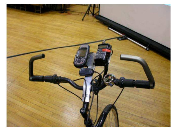
8909 – Jim, N5AOX, up close with radio and GPS